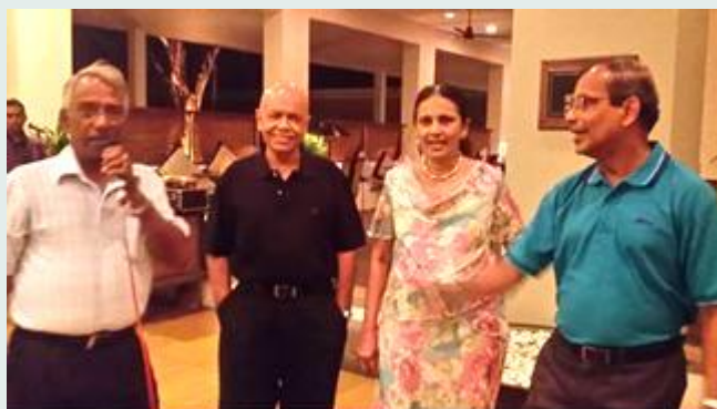
Singing the night away.....

Many alumni members and their families had already checked in at the Hotel Blue Water in Wadduwa on the evening of 6 th September. They gathered at the Hotel Lobby around the legendary “Sam the man” who set the tone for a glorious night of socializing replete with singing and dancing.