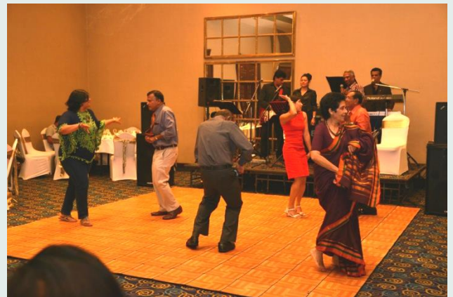
The Baila Dancing Competition