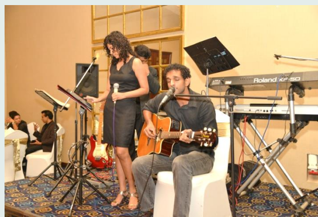
Alumni Talents on display