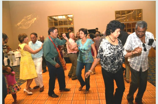
Come on let's dance