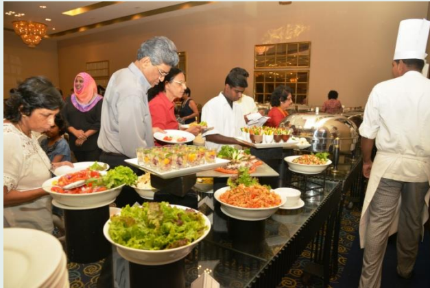
A scrumptious buffet

With these words resonating in the minds of the alumni the rhythm of the musical bands and the exquisite array of food and beverages slowly took over the proceedings.