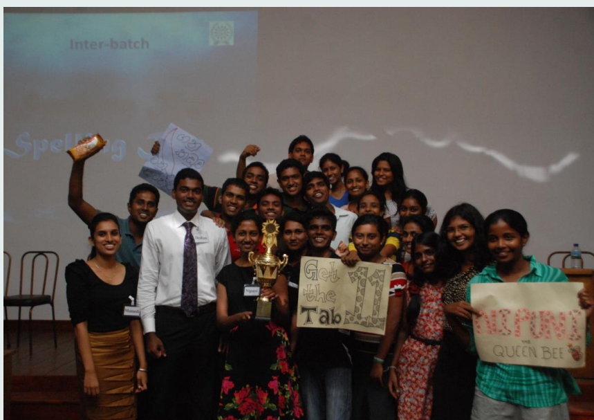
The winners and their contingent.....