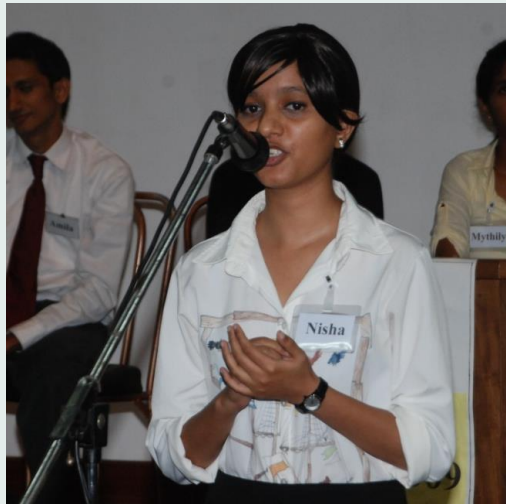
Under the spot light....