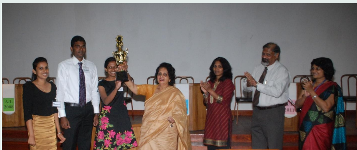
The moment of glory.....