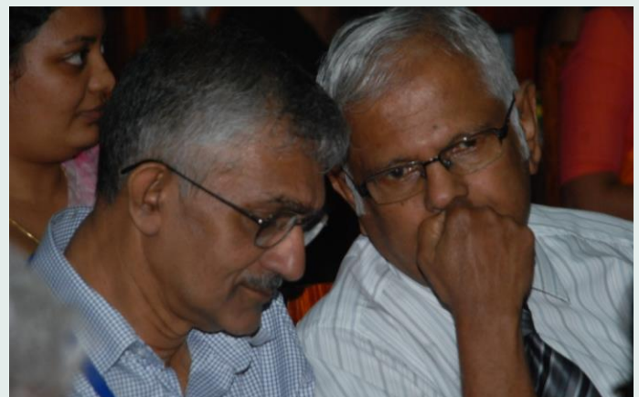
Experts in the audience comparing notes....