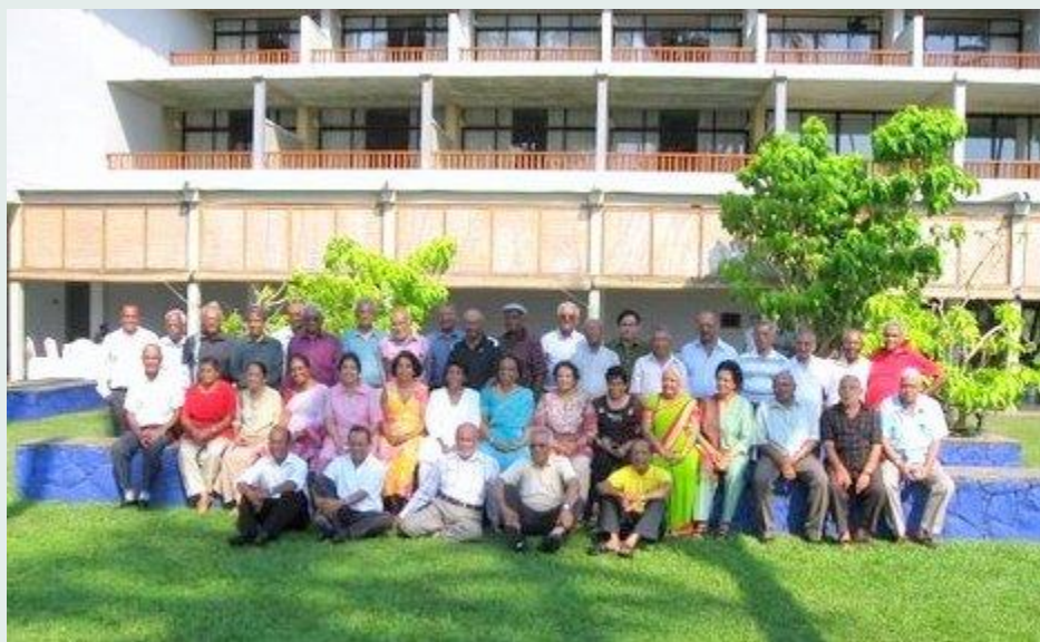
50 year get-together 1959 entrants' batch - Photo sent to COMSAA Blog by Premalatha Balasuriya