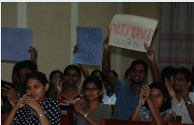
They came ..they saw...they cheered....