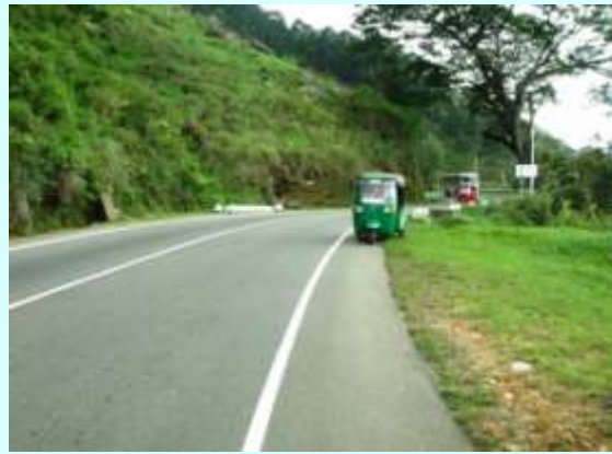
Two views on the road from Beragala to Haputale

A few hundred yards before the Haputhale town there is a road called Temple Road on the left exiting the highway at an acute angle. This passes the CTB Bus Depot. Take this road. About 2 Kms away is a turn off to the left leading to the Thangamalai sanctuary. You turn to this side road a few yards before the railway level crossing. This last 1.2 Km is motor able but is a clay track. This road leads to Adisham. You have to stop at the gate and buy tickets, around Rs. 30/- per person. It is a walk of about 300 yards from there to the Bungalow.