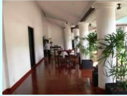
The Belihul-Oya Rest house – Entrance and Veranda

The road from Colombo to Haputhale once you pass Kaluaggala, after you emerge from the Low-Level road (Orugodawaththe- Wellampitiya-Kaduwela-Hanwella) is super up to Haputhale(175 Kms). After passing Belihul Oya Rest-House at the 168/3 bridge you find the ‘Surathalee’ (meaning “female beloved” in Sinhala) waterfall. It is visible from the road but a short walk on a footpath gives one a magnificent view of it.