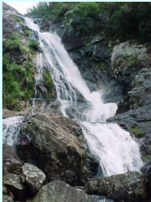
The ‘Surathalee’ waterfall

You turn left at the Beragala junction and climb up to Haputhale. It is really a fantastic sight on this stretch of the road. On a clear day you can see the water reservoirs of Udawalawe, Thanamalvila, Sooriyawewa and Chandrikawewa with the distant blue horizon of the Indian Ocean.