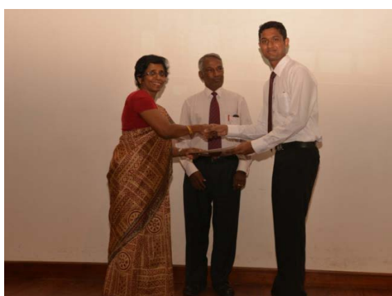
Presentation of Sumi Munasinghe Award