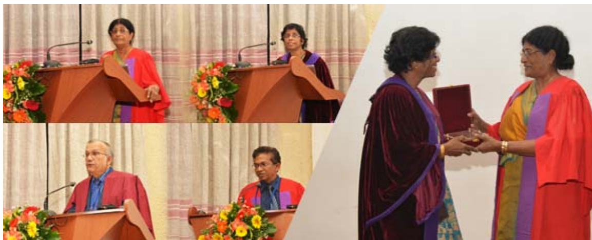
A few memorable moments of the Commencement Lecture for the A/L 2013 batch