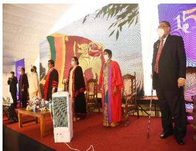
Start of the proceedings

CoMSAA President-Elect proposed the vote of thanks and the gathering made its way to the student common area for the cutting of the cake made to celebrate the 150 th birthday of the Faculty; which was organised by CoMSAA, followed by refreshments. A pictorial account of the proceedings of the morning celebrations are given below, more pictures are available in the CoMSAA website. A design created by the faculty IT department was used as the theme on the birthday cake as well as CoMSAA website home page.