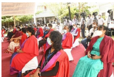
Faculty teachers in the audience