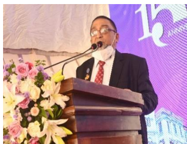
Address by the CoMSAA President