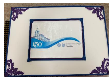
The Faculty Birthday cake