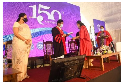
The Anniversary Volume being presented