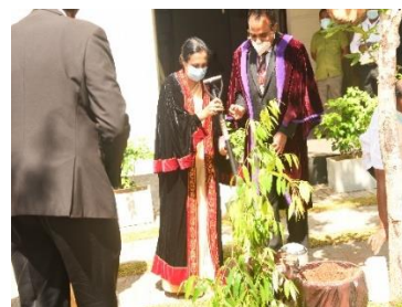
Planting of the symbolic Na sapling