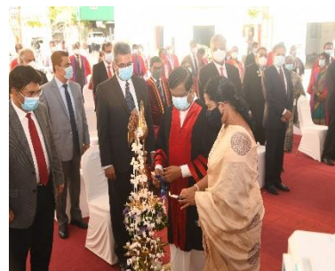
Lighting the traditional oil lamp