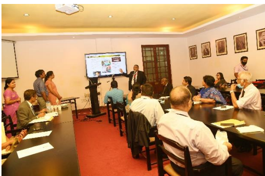
President CoMSAA inaugurating the payment gateway