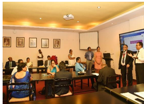
The Faculty Dean speaking at the occasion