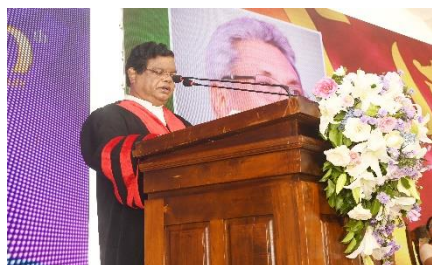
Message from. Hon. President of Sri Lanka being delivered